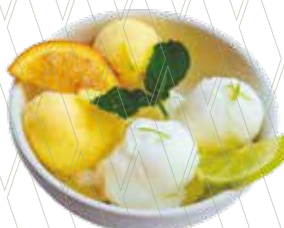
Citrus sorbets duo by Sandro Desii 5,45€