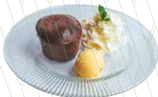
Belgian chocolate coulant with vanilla ice cream 5,75€