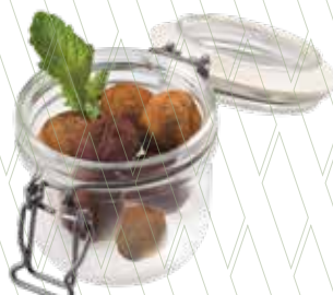
Artisan chocolate truffles 5,45€