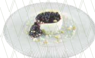
Cheesecake with blueberry marmalade 6,25€