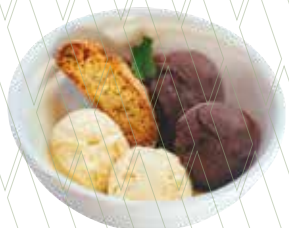
Artisan vanilla and Belgian chocolate ice cream duo by Sandro Desii 5,45€