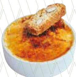
Catalan crème brûlée with biscotti 5,75€