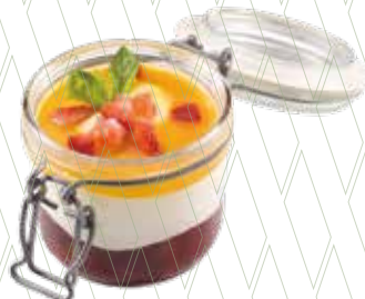
Yoghurt cream with red and passion fruits 5,75€