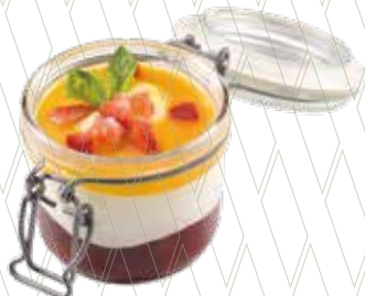
Yoghurt cream with red and passion fruits 5,25€