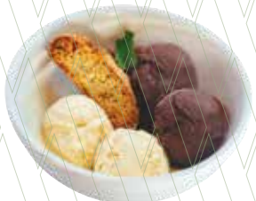
Artisan vanilla and Belgian chocolate ice cream duo by Sandro Desii 4,95€