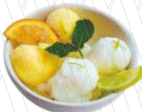
Citrus sorbets duo by Sandro Desii 4,95€