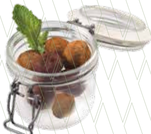
Artisan chocolate truffles 4,95€