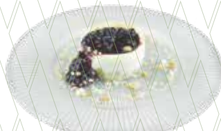
Cheesecake with blueberry marmalade 5,75€