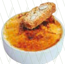
Catalan crème brûlée with biscotti 5,25€