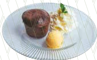
Belgian chocolate coulant with vanilla ice cream 5,25€